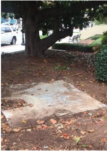
The vacant location where the Confederate Memorial once stood at the Madison County Court House.

In the Dark of night , Thursday, October 22 nd the City/County politicians removed the Confederate monument from the courthouse grounds to Maple Hill Cemetery. An attempt to get an injunction to prevent the removal was refused.