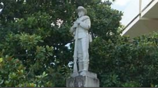
Statue side of the 1960's Madison County Courthouse.

Now, just as in the beginning of the organization, the UDC Chapter continues to honor the men who serve their country. During World War I, the chapter