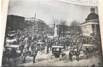
Confederate Veterans Magazine, 1905.